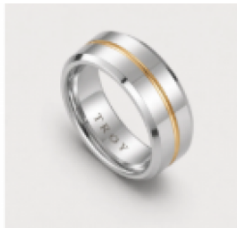
The Sovereign $100.00