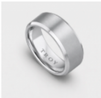
The Sentinel $100.00