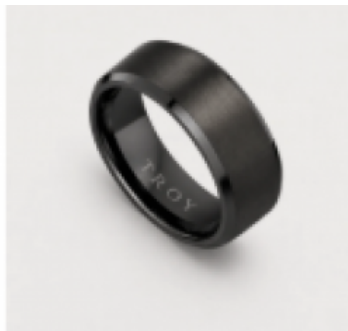
The Titan $100.00