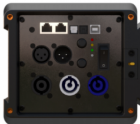
Model: VM-A5-O (Passive version)