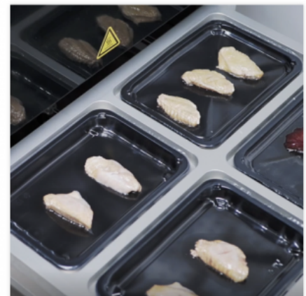
Step6: Take the tray out.

Wenzhou, Zhejiang Apr 21, 2026 (Issuewire.com) - For resellers operating within the global food processing and packaging sector, the challenge of sourcing equipment that balances technological sophistication with long-term reliability is constant. In an era where food safety and shelf-life extension are paramount, providing clients with a reliable Automatic Skin Pack Machine is no longer just an option but a necessity for maintaining a competitive edge. Resellers often face the pressure of balancing their customers' demands for high productivity against the potential risks of technical downtime and complex maintenance. Choosing the right partner requires a deep dive into the engineering nuances that define performance, operational ease, and automation levels.