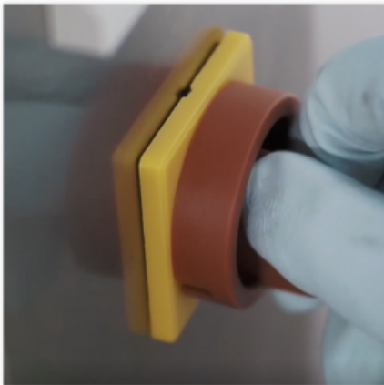
Step1: Turn on the main switch