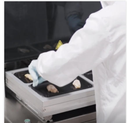
Step3: Put the tray on the mold