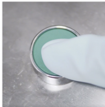
Step5: Press both start buttons at the same time