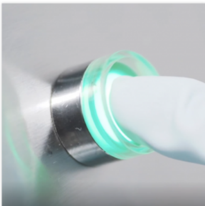
Step4: Click the start switch