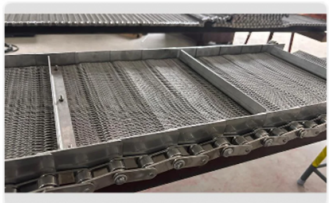
Premium Balanced Compound Belts Stainless Steel

Coimbatore, Tamil Nadu Apr 9, 2026 (Issuewire.com) - The demand for reliable and high-performance conveyor components is rapidly increasing across industries such as manufacturing, packaging, pharmaceuticals, food & beverage, and automotive.