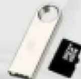
U disk/TF Card