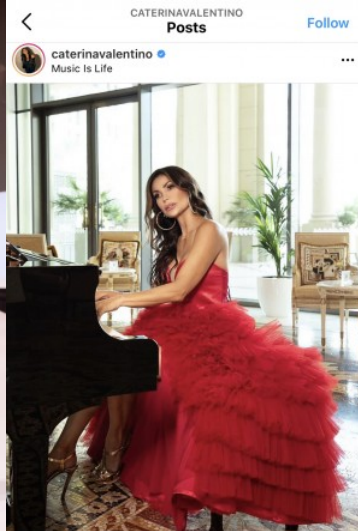
6.752 likes caterinavalentino Quién más no puede vivir sin música? Yo hasta para la la oigo! Feliz domingo mis guapis y mis pequeñas! @gabrielrphotography