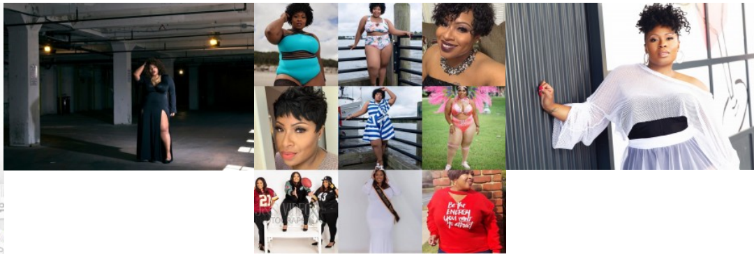
♥ 6,753 Likes to 154 posts in 2019! janellethecurdydoc Thank you for your likes!